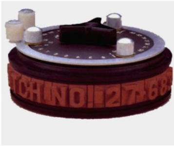
A. CHANNELOK TYPE IN KIWİ MODEL 451 MARKING WHEEL