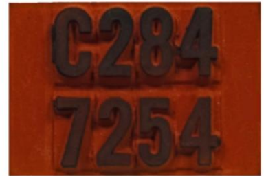
C. TWO-LINE LOGO