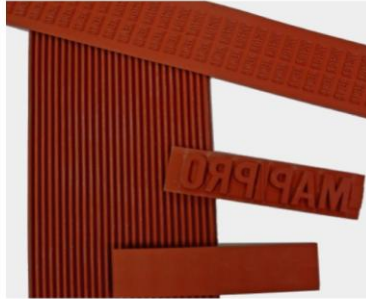
B. SINGLE LETTERS, NUMBERS OR FULL WORDS (LOGOS)